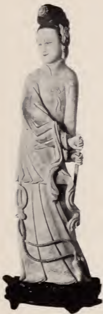
TALL CARVED IVORY FIGURE